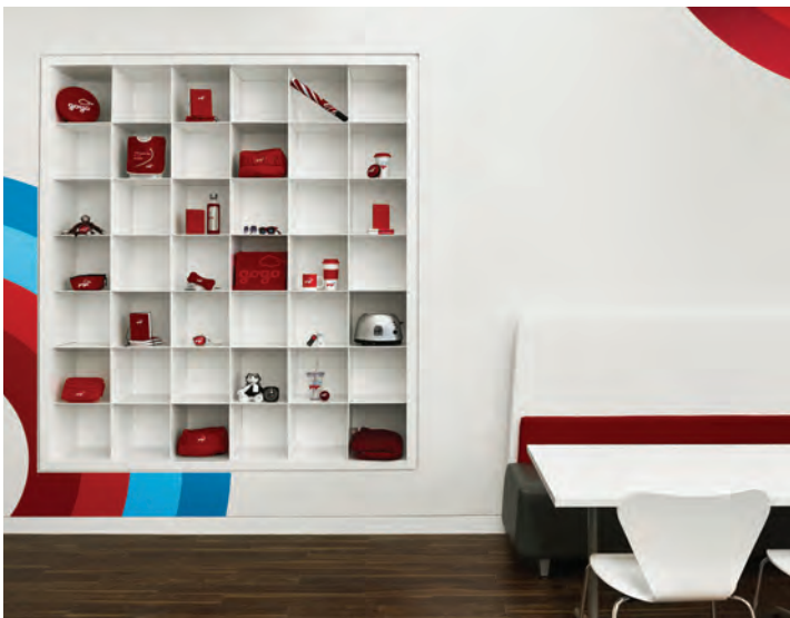
Seating + Display Vignette