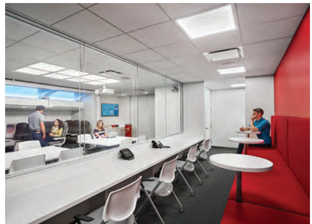
Lab + Viewing Room