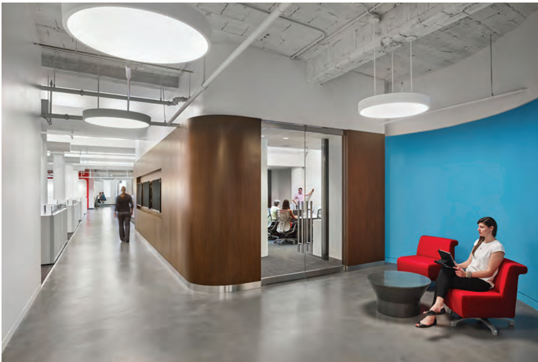
Conference + Break Out Space