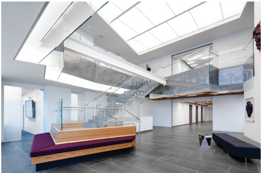
Reception / Atrium