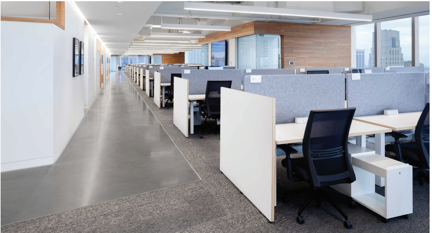
Open Office / Workstations