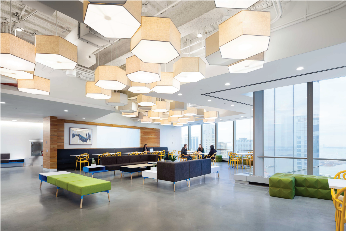
Multi-Purpose Collaborative Space