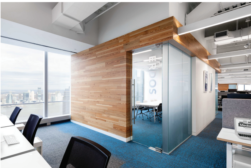
Workstations / Teaming Room