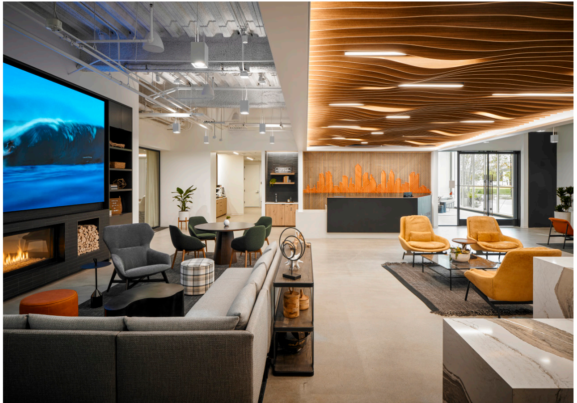
Lobby + Lounge

Cushman & Wakefield (C&W), a global real estate services firm employing over 50,000 people across 400 offices in 60 countries, sought to consolidate several of these offices into a new building in a premier location in San Diego, California. They wanted to use this consolidation as an opportunity to challenge traditional work styles and migrate to a live-work model with no permanent assigned work areas for employees.