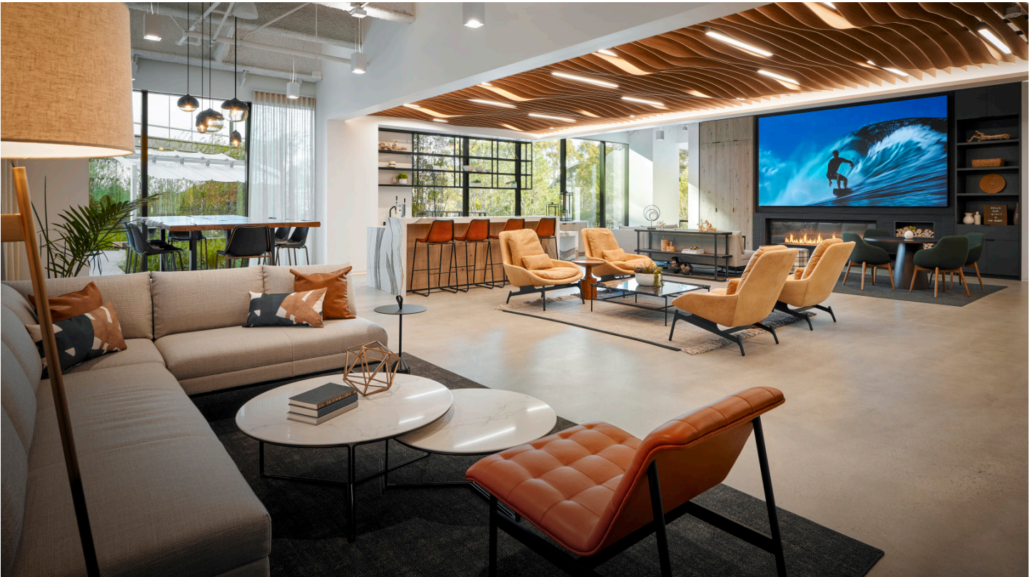
Lobby + Lounge