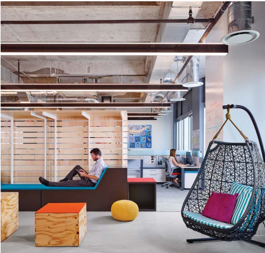
Views from the Cafe to workstations