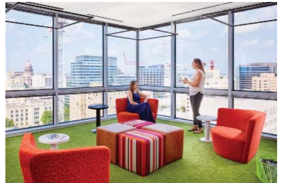
Corner Conference Room