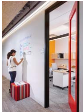
Private Office + Writable Walls